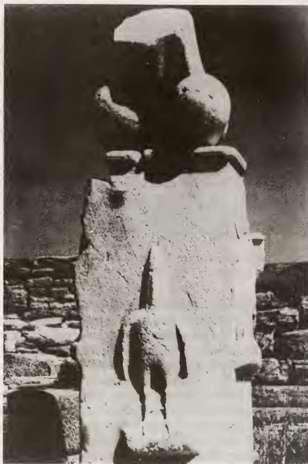
Fig. 2. A relief of a cock on a monument in honour of Dionysius from the island of Delos, Greece (3rd century B. C.) (after Т а х о - Г о д и, 1989)

Iskar River (off Gigen) (p. 231). Such an image exist indeed (Fig. 1), however with a clear mistake, as Oescus was a Roman town, not a Thracian one, and Oescus was in existence for about 600 years from the end of 1st century B. C. to the 6th century A.D. Thus the mosaic of Oescus may prove that the Domestic Fowl was already present in the Bulgarian lands by the end of the 1st millenium B.C.